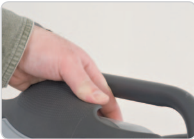
Ergonomic Soft-Touch™ paddle system provides simple, intuitive control and safe operation. Up to 20% greater productivity compared to simple switch controls.