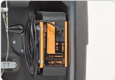
An onboard battery charger for optional wet or gel battery packages lets you recharge the machine from any outlet.