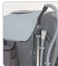
Onboard scrub-vac system