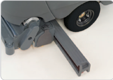
Cylindrical scrub decks sweep and scrub in a single pass with dual counter-rotating brushes.