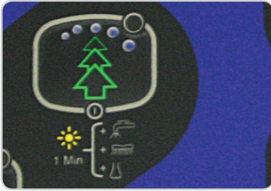
EcoFlex™ System models have One-Touch™ activation for an on-demand cleaning burst of power.