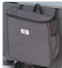
Onboard tote bag